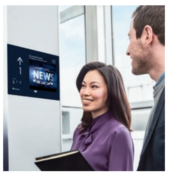
The KONE InfoScreen is an open channel of communication between you and elevator passengers.