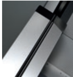
Powder coating silver