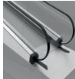
Clear glass balustrade panels