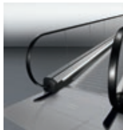
Continuous LED skirt lighting