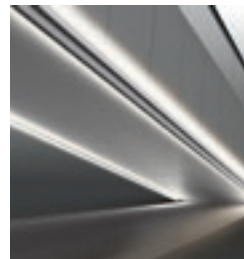
LED cove lighting Side and soffit cladding