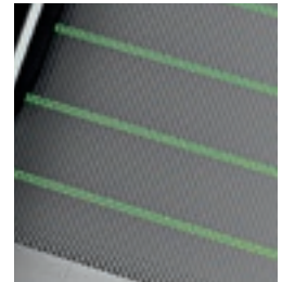
Pallet demarcation lighting