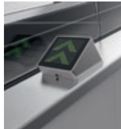
Traffic light cube