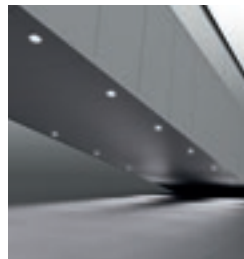
Soffit LED spot cladding lighting