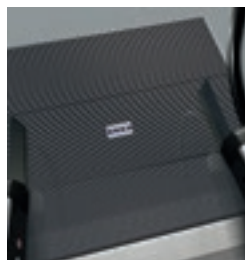
Ribbed aluminum with black grooves