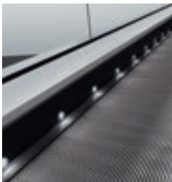
LED skirt spotlighting