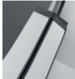
Natural anodized aluminum