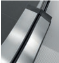
Brushed satin stainless steel