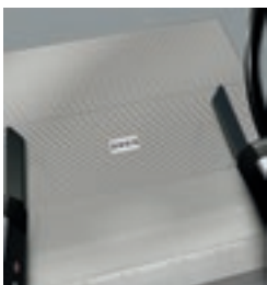
Natural ribbed aluminum