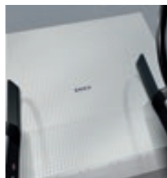
Stainless steel surface (diamond pattern)