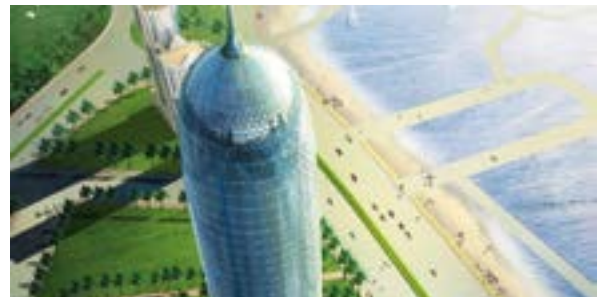
Doha High Rise, Doha, Qatar