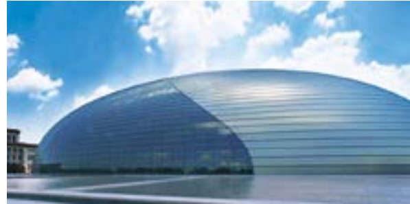
National Grand Theater, Beijing, China