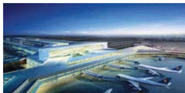
Hongqiao International Airport and Transportation Junction, Shanghai, China