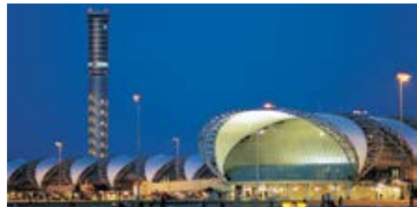
Suvarnabhumi Airport, Bangkok, Thailand